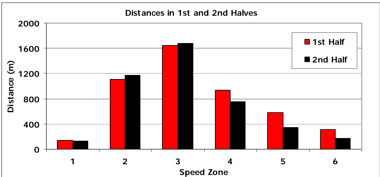
Figure 2: Zonal Distance in Hockey Match

From tables 3 and 4 and figure 3 we can see that the athlete covered approximately 9km during the match. We also see that there was a decrement in distance covered of 9.9% between the 1 st and 2 nd halves (this is relatively typical). However, what is most striking about this data is the decrement in high intensity distance between halves, a massive 42.5%. Figure 2 illustrates that although a relatively similar amount of distance was covered the nature of that distance changed significantly with zones 2 and 3 (walking and jogging) increasing and zones 4-6 decreasing.