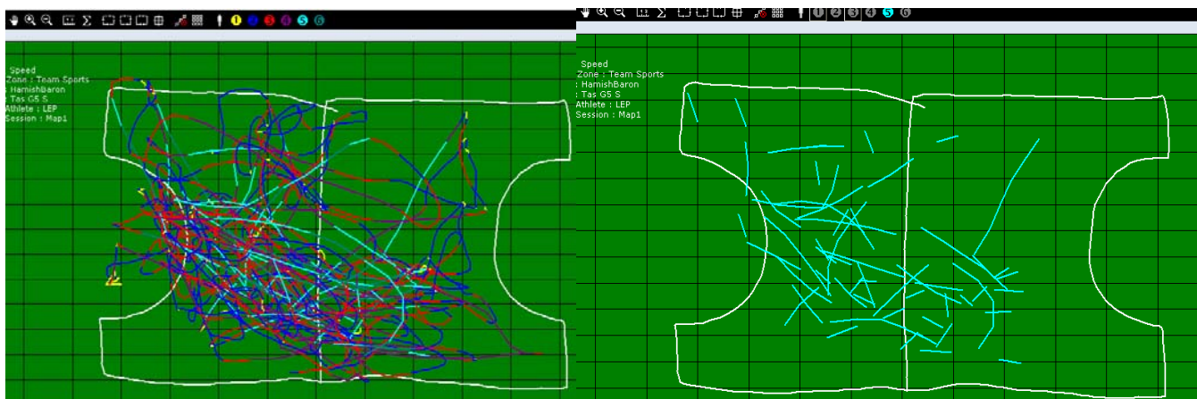
Figure 5: Position during the first half