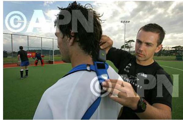
Figure 1: GPS Device (usually worn under the shirt).

To allow for comparison between data sets (either between players in different positions, players in