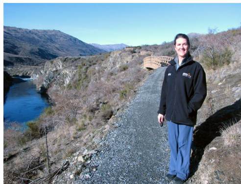
Gibbston River Trail