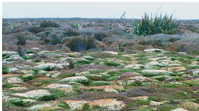
Waituna Wetlands in flower

NB - May 18 – Planning meeting – 1.30pm Upstairs in the Sarah Ulmer Lounge – ILT Velodrome. Come along with your ideas and walks for the planning of the next 3 months.